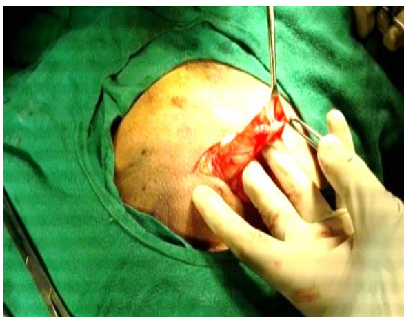
Fig. 1: Identification and opening of hernia sac