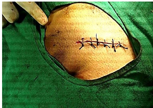
Fig. 3: Closure of skin incisions