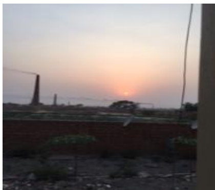
The stepwise operative steps of hernia repair